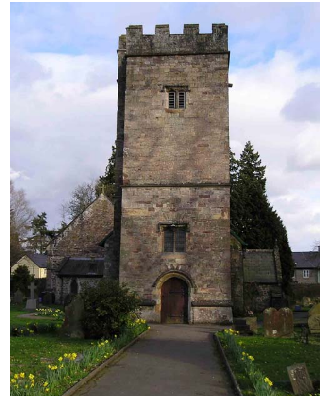
St Michael and All Angels, Llantarnam

The churches in this leaflet are registered with Churches Tourism Network Wales.