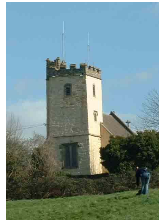
St Mary, Portskewett

The churches in this leaflet are registered with Churches Tourism Network Wales.