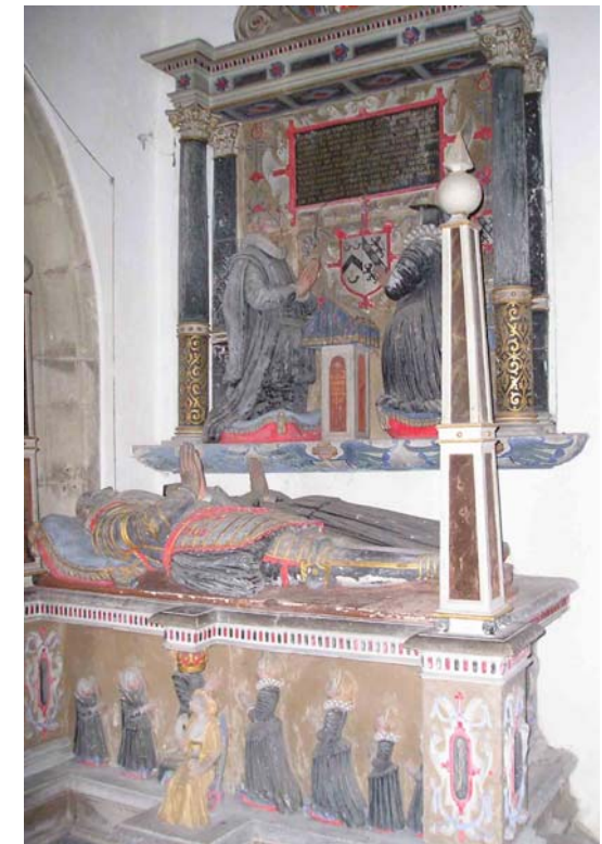
Family tomb at St Illtyd's Llantrithyd

These churches are open during September 2011 for Open Church Day (17th September) and other Open Doors events