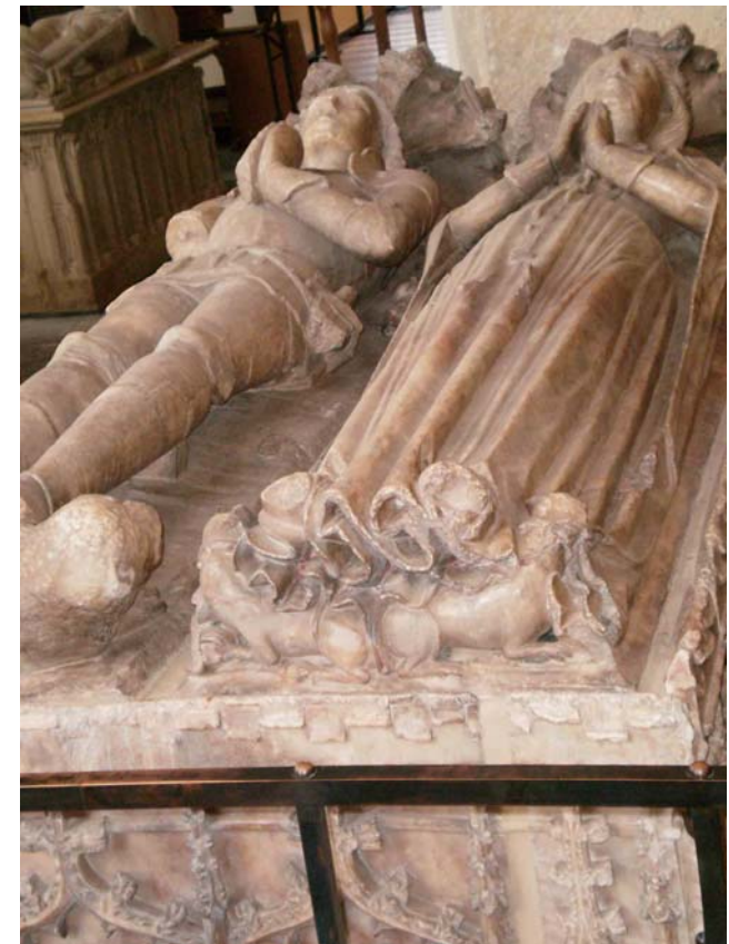
Medieval effigies in St Mary's Priory Church, Abergavenny

Produced by the Glamorgan-Gwent Archaeological Trust ggat.org.uk