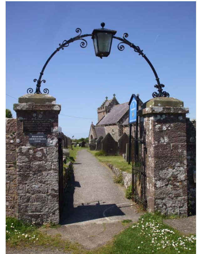
St Madoc's, Llanmadoc

Produced by the Glamorgan-Gwent Archaeological Trust ggat.org.uk