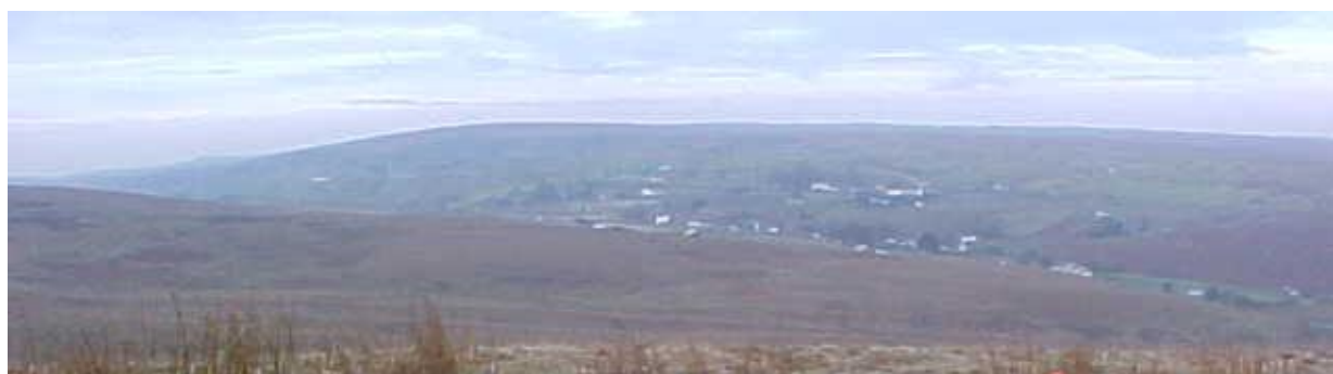
The view eastwards from the cairn

Its position is a typical one too, situated in a prominent position on a spur of slightly higher ground on a mountain plateau. It has extensive views to the north-east, east and south-east, but on the western side the long-distance views are blocked by the high ground of Cefn Pyllau-duon.