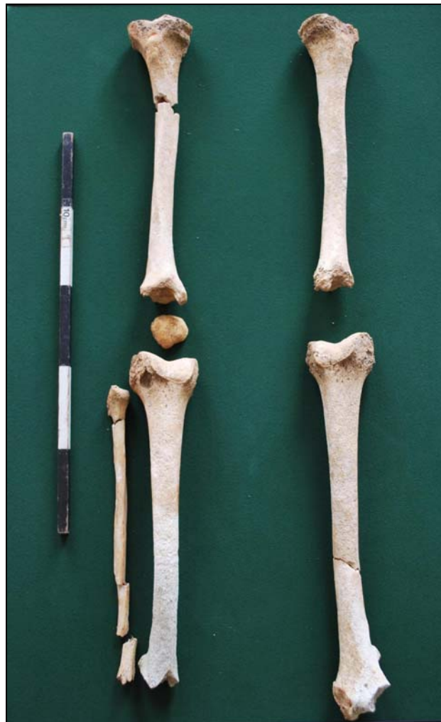
Plate 4. Lower limb remains recovered from the excavation, with 50cm scale