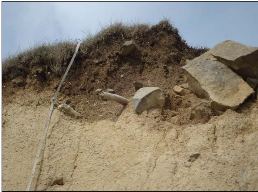
Plate 3. View of grave cut and skeletal remains, looking northeast