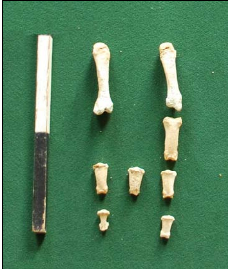
Plate 5. Finger bones recovered from the excavation, with 20cm scale