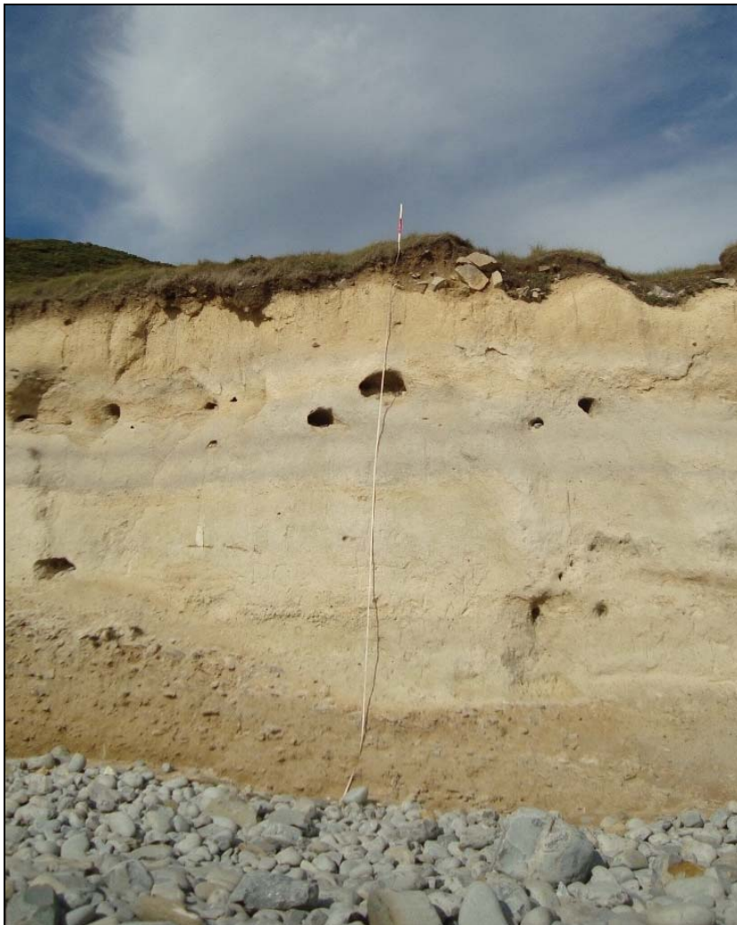
Plate 2. View of grave cut at cliff top (right of scale), looking northeast