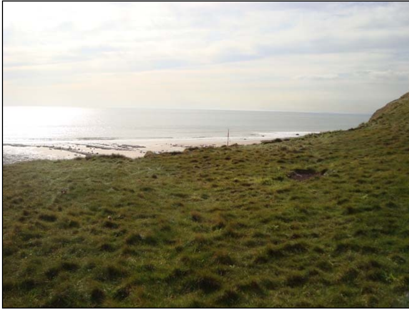
Plate 1. View of excavation area, looking west